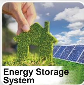
Energy Storage System